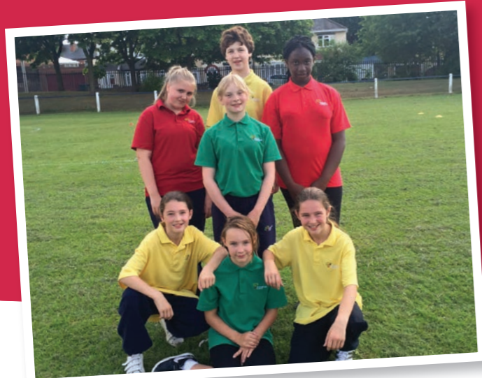
Table Tennis Hub

Competing against schools including St Michaels, Oldbury Academy, Perryfields and Ormiston Forge, the girls have developed their skills and understanding of the game along with gaining vital match play experience. Well done girls!