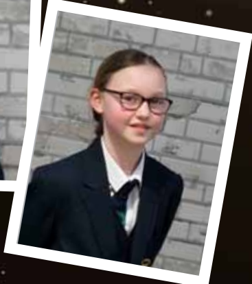
Year 7 Sky